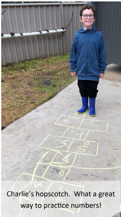
Charlie's hopscotch. What a great way to practice numbers!